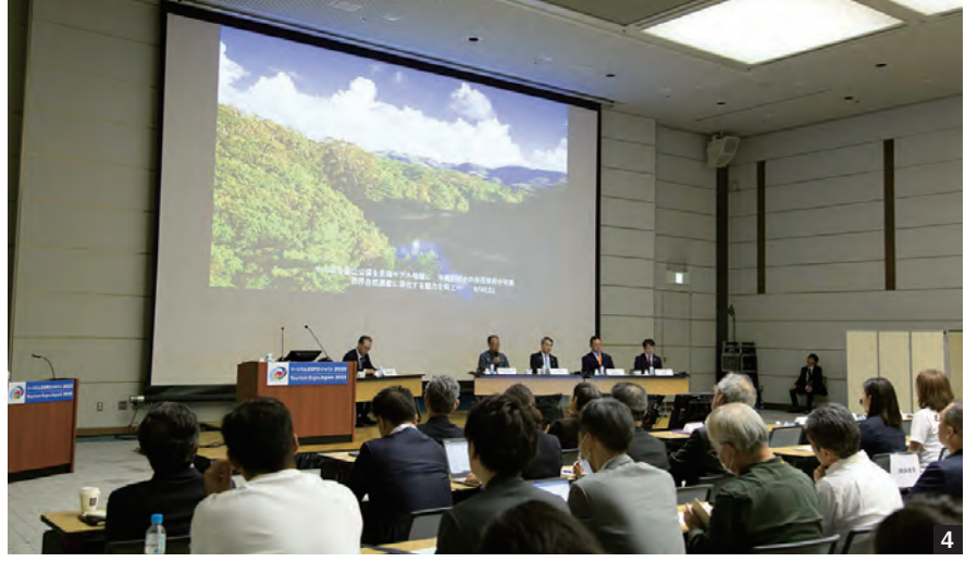
Scenes from TEJ 2023 which was held in Osaka for the first time in four years ( The 6th Tourism MInisterial Roundtable with representatives from nine countries, Scenes from the grand finale, Exhibition booths bustling with visitors; Thematic Symposiums featuring Expo 2025, adventure tourism, and so on.)