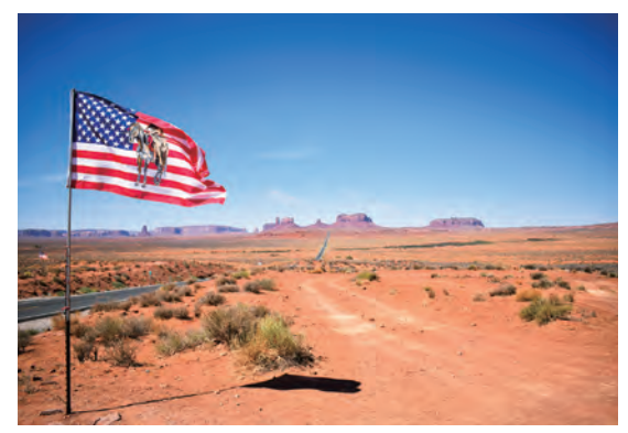
The U.S. Travel Planning Contest expects innovative ideas from young people. (Photo: Monument Valley)

The Welcome Reception on September 26th will bring together domestic and foreign guests, sponsors, and business meeting buyers and exhibitors, creating an unparalleled business networking opportunity. It will showcase food and cultural performances from various parts of Japan, as well as traditional performances from the Noto region as part of earthquake recovery efforts.