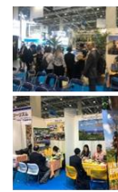
Adventure Tourism 2019